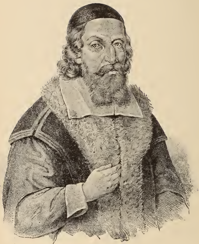
JOHN AMOS COMENIUS.